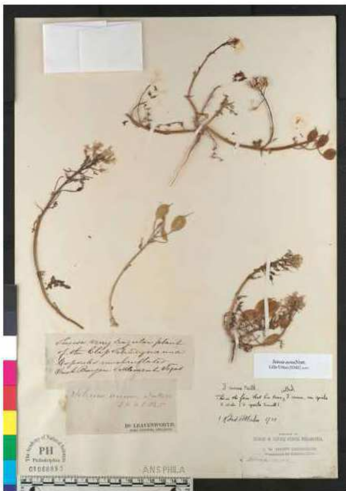
Figure 1. Selenia aurea (M.C. Leavenworth s.n.). Photo from Herbarium PH, Botany Department, Academy of Natural Sciences, Philadelphia. Information provided with the permission of The Academy of Natural Sciences.